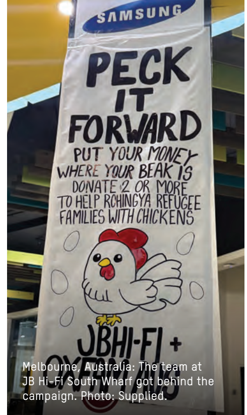
Melbourne, Australia: The team at JB Hi-Fi South Wharf got behind the campaign.

"What can I say? Thank you hardly seems enough. We are just so very grateful."