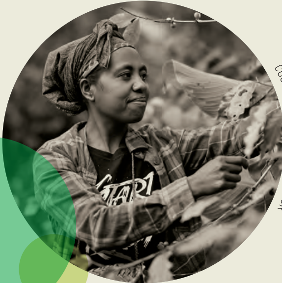
COOPERATIVA CAFE, EAST TIMOR