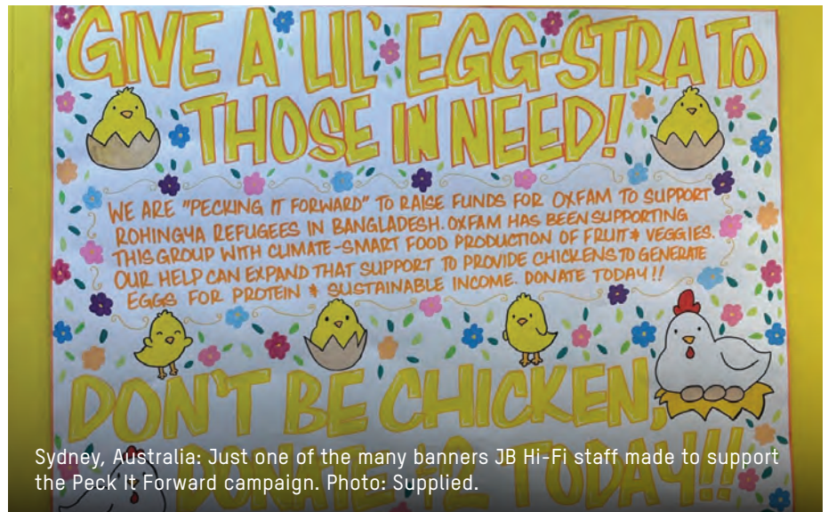
Sydney, Australia: Just one of the many banners JB Hi-Fi staff made to support the Peck It Forward campaign.