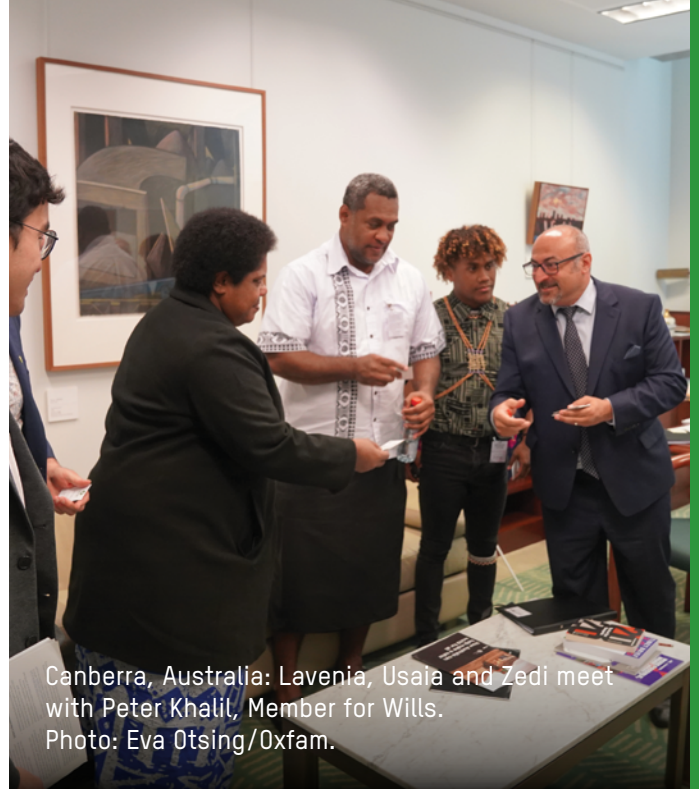
Canberra, Australia: Lavenia, Usaia and Zedi meet with Peter Khalil, Member for Wills.

Those who have benefited the most from the mining and burning of fossil fuels – the big polluters – need to pay for all the loss and damage they have caused communities.