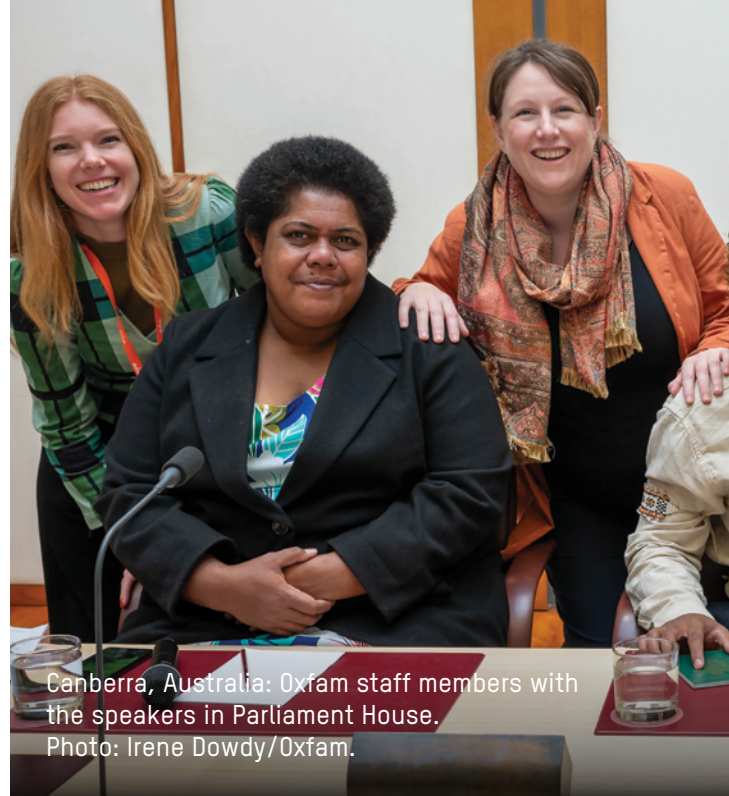
Canberra, Australia: Oxfam staff members with the speakers in Parliament House.